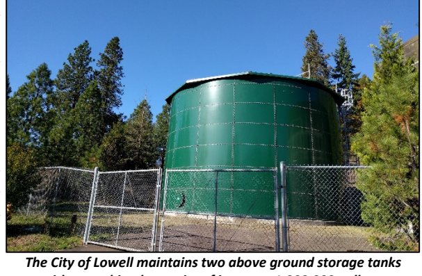
with a combined capacity of just over 1,000,000 gallons.

As part of their report, the OHA noted that the Lowell water system is "well-operated and maintained by knowledge-